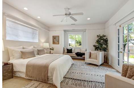
107 S. Gramercy Place Los Angeles, CA 90004